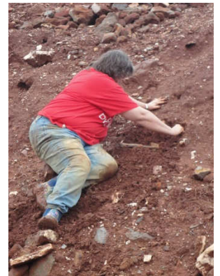
(editor: I think NMGMS members like getting in the mud!!)