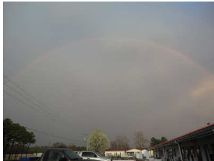
Rainbow in Mt. Ida