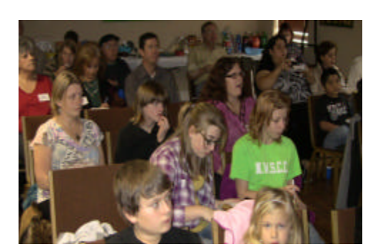
NMGMS Members Listening Carefully.