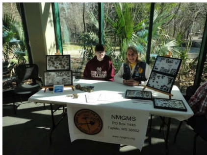
NMGMS Information Table