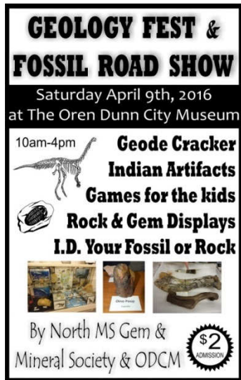
Poster by Alison Schuchs