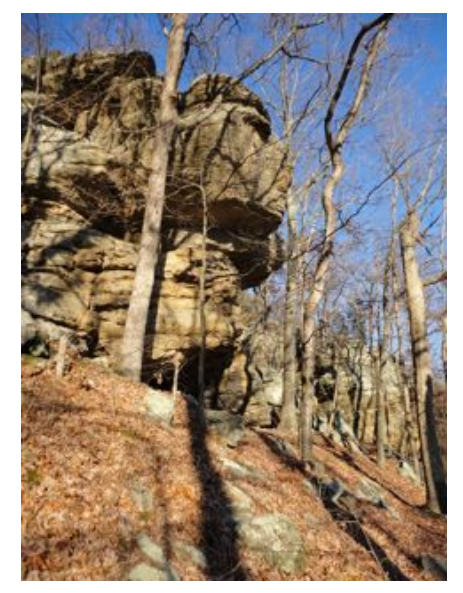
The Garden of the Gods.

These sandstone formations also contain iron deposits called "Liesegange bands". These deposits do not erode as quickly as the surrounding rock, thus leaving bands of iron which form intricate swirling patterns. Many of the boulders contain small, very white pebbles that are in rows and clusters, making them look like they were deposited right at the water's edge! At the Garden of the Gods Wilderness Area, one can take several hiking trails which lead you up over and ground these many along wonders of At the Garden of the Gods Wilderness Area, one can take several fiking trails which lead you up, over and around these marvelous wonders of nature. This recreation area has a flagstone covered observation trail, horseback riding trails, hiking trails, a campground and picnic area and backpacking trails. The park is open all year. So, if you happen to be passing through Illinois and would like a change from the flat farmland scenery, this National Forest Service recreation area is absolutely well worth the visit!