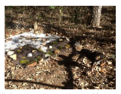
Above Nobi showing off pre-tulle garden. Left, moss, with lichen. Above left, garden with tulle. Top left, tin roof of a collapsed moonshiners' shack, where moss was specimens where taken. See p 7

Water (do NOT use tap water-it will almost immediately kill your moss. Collecting rainwater is the best, If you have a friend with a well that has very pure water, use that, otherwise distilled water. Distilled. Not bottled-bottled is nearly all from a tap.)